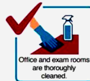
Office and exam rooms are thoroughly cleaned.

We are taking extra precautions against COVID-19 to help protect our patients and staff.