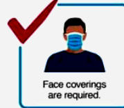
Face coverings are required.